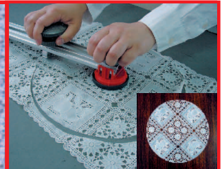
Making tableclothes and coasters.