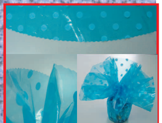
Wavy cut to decorate wrapping.